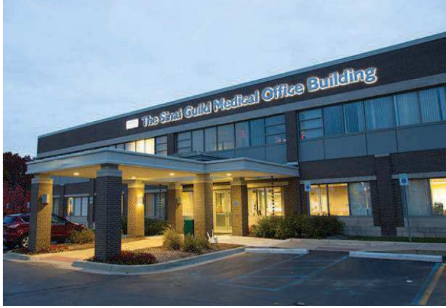
DMC Orthopaedics & Sports Medicine – West Bloomfield

6525 W. Maple Road, Suite 101E West Bloomfield, MI 48323